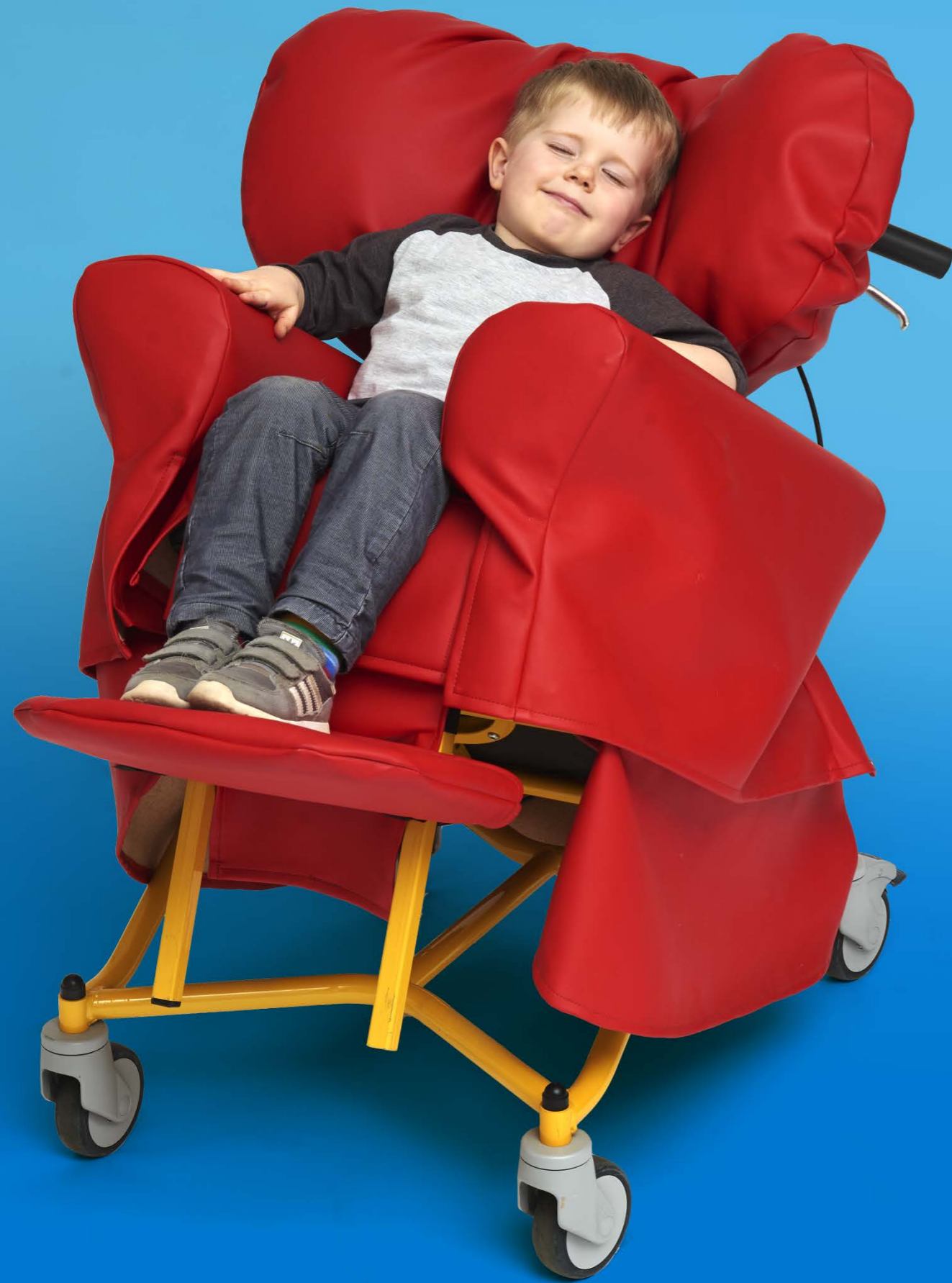
A 'Chill-out' chair for watching TV or relaxing Use it for free time, learning, activity at home or at school